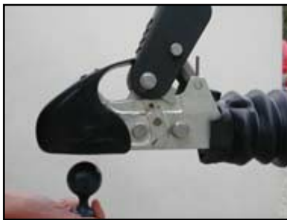
Illustration of front horizontal bolt.

N.B You may find it helpful to have everything close at hand and the lock bolt in the unlocked position separated from the cup, because the hitch lock needs to be held in place with one hand.